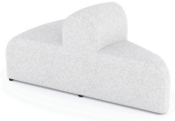
Double Side 30° Seat KORD30