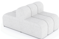
Double Sided Triple Seat KORD3