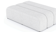
Double Sided Triple Bench KORDB3