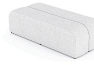
Double Sided Double Bench KORDB2