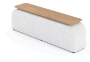
Double Sided Bench w/ Laminate Top KORDB1-LT