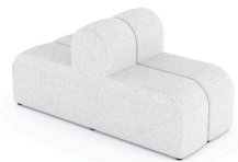
Double Sided Double Seat KORD2