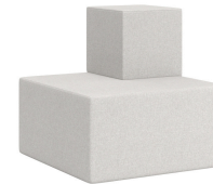
Outside Corner KAEK