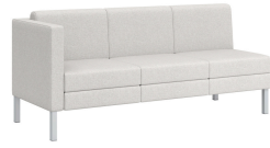
Three Seat w/ Arm (R) BOX3R