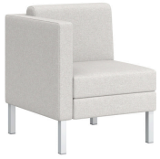
One Seat w/ Arm (R) BOX1R