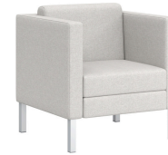
One Seat w/ Arms BOX1A