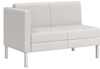
Two Seat w/ Arm (R) BOX2R