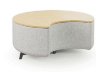
Crescent Bench w/ Laminate Top FLOC-LT