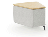
Wedge Bench w/ Laminate Top FLOW-LT