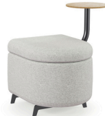
D-Shaped Bench w/ Tablet Arm (L) FLOE-TL