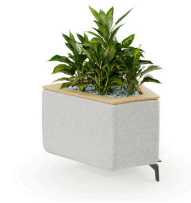
Wedge Bench w/ Laminate Top + Planter Insert FLOW-PB