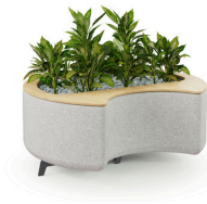
Crescent Bench w/ Laminate Top + Planter Insert FLOC-PB