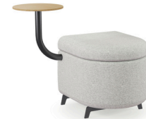
D-Shaped Bench w/ Tablet Arm (R) FLOE-TR