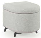
D-Shaped Bench FLOE