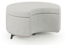
Crescent Bench FLOC

The Flo collection is covered under Flexxform's 25-year warranty. For more information, visit www.flexxform.co/warranty .