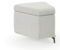
Wedge Bench FLOW