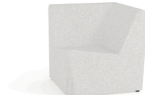
90° Inside Corner EVE90IC