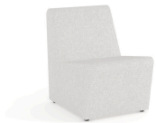
One Seat EVE1

The Everlin collection is covered under Flexxform's 25-year warranty. For more information, visit www.flexxform.co/warranty .