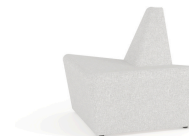
90° Outside Corner EVE90OC