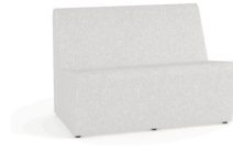
Two Seat EVE2