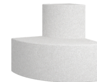
Radius Corner KAERC