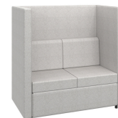
Two Seat Privacy Back w/ Arms