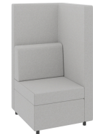
One Seat Privacy Back w/ Left Arm ION1L-PB