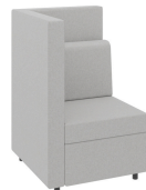
One Seat w/ Right Arm ION1R