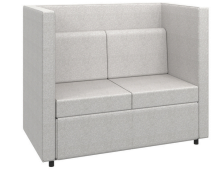
Two Seat w/ Arms