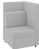
One Seat w/ Left Arm ION1L