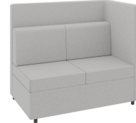
Two Seat w/ Left Arm