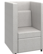
One Seat w/ Arms ION1A