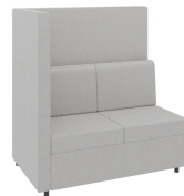
Two Seat Privacy Back w/ Right Arm