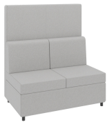
Two Seat Privacy Back