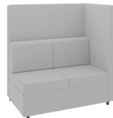
Two Seat Privacy Back w/ Left Arm