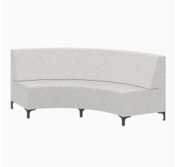
90° Inside Curve