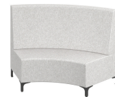
60° Inside Curve High Back IVY60I-HB