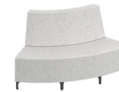
60° Outside Curve IVY60O