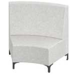
45° Inside Curve High Back IVY45I-HB