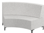
60° Inside Curve IVY60I