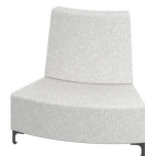
45° Outside Curve High Back IVY45O-HB