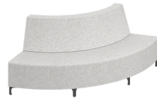
90° Outside Curve