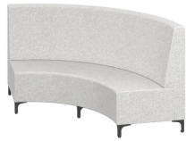
90° Inside Curve High Back