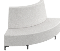
90° Outside Curve High Back